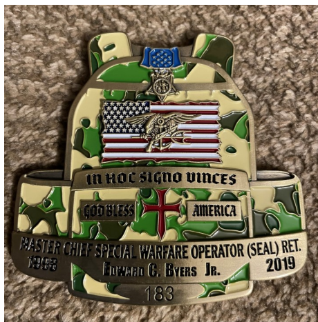
Ed Byers Challenge coin